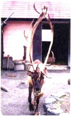
トナカイのチョッパー Chopper the Reindeer