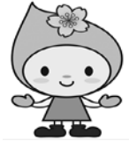
Hamura City Mascot "Hamurin"

*For more event details and parking information, please see Hamura News March 15 th Edition