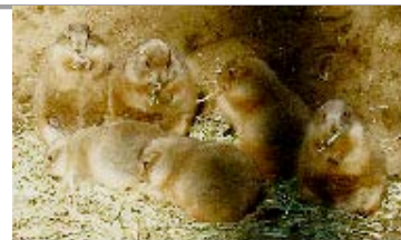
Photo: Prairie Dogs of the Hamura Zoo

It is the Year of the "Dog" Please come to the Hamura Zoo to come see us!