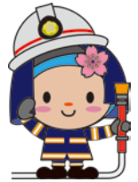
Hamurin the Fireman

Inquiries: Fussa Fire Department Hamura Dispatch Unit ☎042-554-0119, Ext. 804 Hamura Zoo ☎042-579-4041