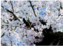
Sakura flowers blooming on a tree

Hamura News Back Numbers = http://www.city.hamura.tokyo.jp/category/3-17-2-0-0.html